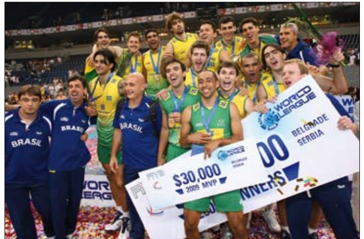
Brazil will be looking to repeat their FIVB World League victory last year in Belgrade, Serbia when the competition reaches its climax in Cordoba, Argentina