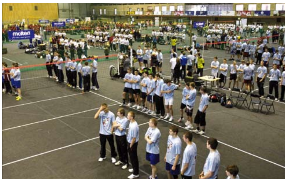
A total of 106 teams attended this year's final in Riga, Latvia, a record for the tournament

port of the Riga City Council, organized the competition for the ninth time. During the past nine years the Lases Cup has become the largest and most popular Volleyball competition for school teams in Latvia. A total of 66 teams participated in the first final, but this year a record-breaking number of 106 attended the last stage of the competition.