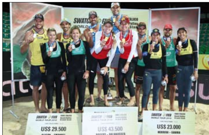
The top three teams from both genders on the podium at the first Grand Slam of the 2010 SWATCH FIVB World Tour in Rome, Italy on May 23