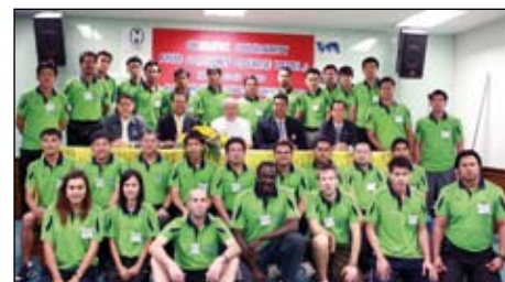
Successful FIVB courses took place (from top to bottom) in Senegal, Uganda, Argentina and Thailand in May