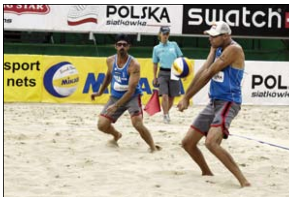
Dalhausser and Rogers celebrated victory in Poland as Juliana and Larissa claimed the Seoul Open title in Korea

The top-seeded Dalhausser and Rogers scored a 21-15 and 21-13 win in 36 minutes over fourth-seeded Adrian Gavira and Pablo Herrera of Spain to share the $30,000 first-place prize on the final day of competition while Juliana and Larissa outlasted fourth-seeded Angie Akers and Tyra Turner of the United States, 21-11 and 21-18 in their 33-minute final.