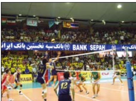
Iran (right) beat China in the final of the Asian Boys' Youth Volleyball Championship on May 21 claiming the final berth for the YOG

Iran beat China in front of their home fans in Tehran in the boys' tournament on May 21 before Japan beat China in