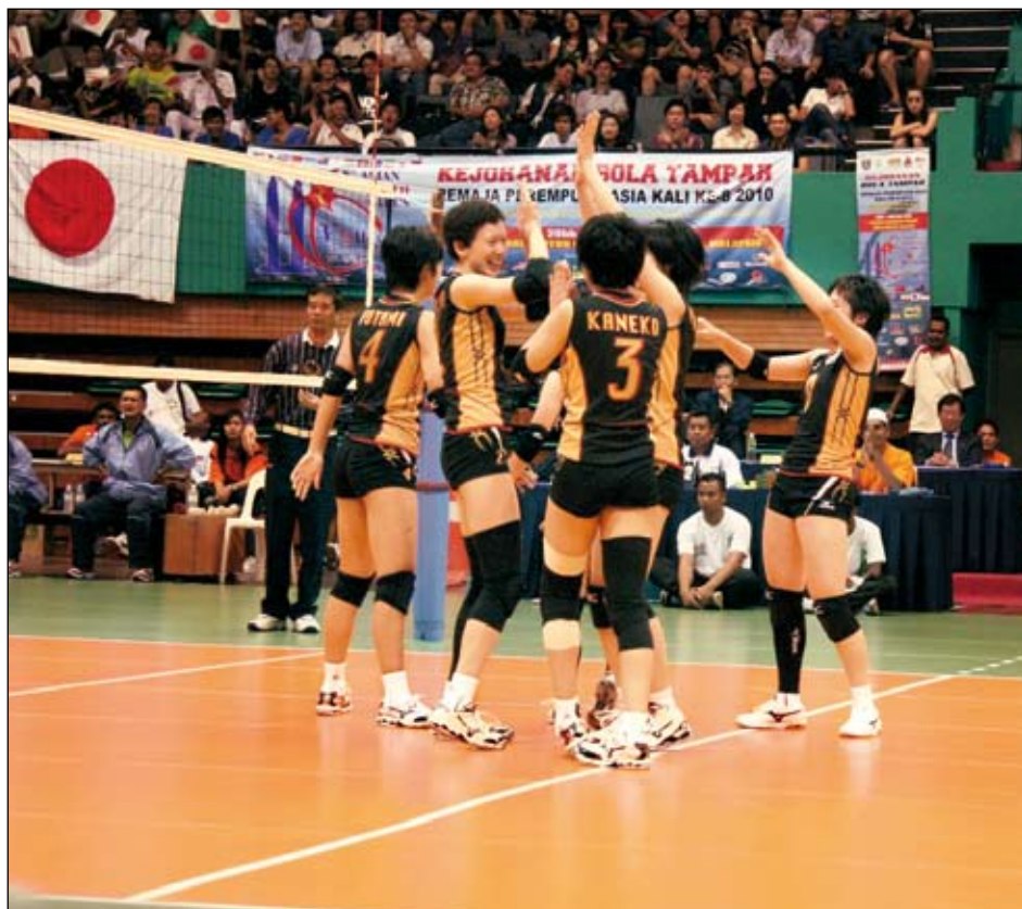
Japan celebrate victory at the Asian Youth Girls' Volleyball Championship. They will now travel to Singapore later this year for the Youth Olympic Games

As well as qualifying for the Games, Japan, as well as China and bronze-medalists Thailand, qualified for the 2011 FIVB Girls' Youth Volleyball World Championship.