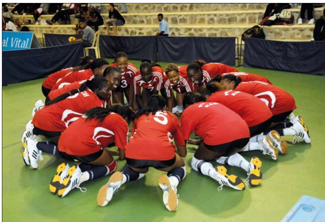
Kenya Prisons overcame Kenya Pipeline in the final of the 2010 Women's African Club Championship and will represent the region at the FIVB Club World Championships later this year

The side will now represent Africa at the FIVB Club World Championships, due to be held in Doha, Qatar from December 14-21, joining Italian side Volley Bergamo who qualified for the tournament after beating Fenerbahce from Turkey 3-2 (25-22, 25-21, 22-25, 20-25, 15-8) in the final of the CEV Indesit Champions League on April 4.