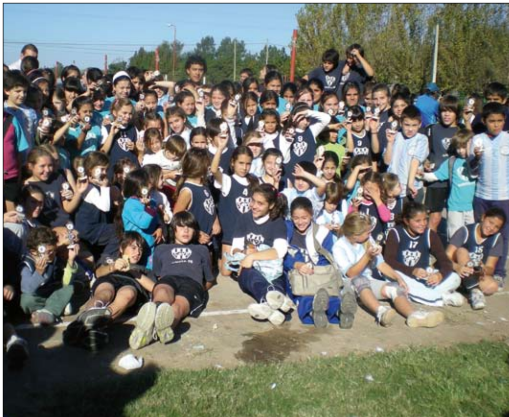
The Venezuela Volleyball Federation hopes their new development initiative will strengthen their youth programme in the coming years

According to the FEVE, the competitions' participants will help form the bulk of the national teams that will participate in next year's U14 Girls' and U15 Boys' South American Championships, established at the South American Volleyball Federations' 63rd Congress held last April in Rio de Janeiro, Brazil.