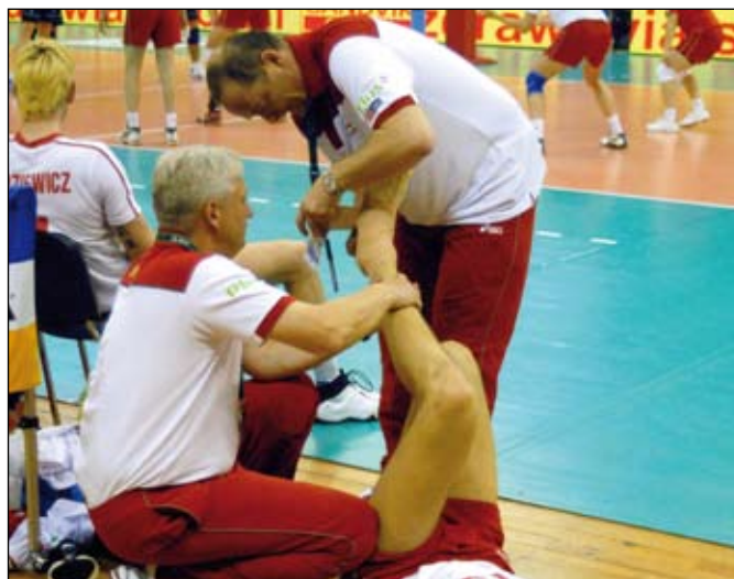
Injury risk in Volleyball is much lower than many other sports however the Medical Congress is designed to help lower this risk even further